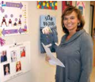
Spotlight on Wellness Challenge..... 3