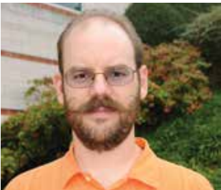
Our College Family ..... 4