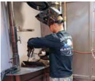
ARC Grant Funds More Welding Booths ..... 7